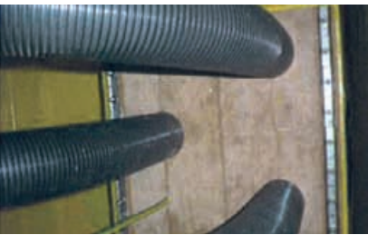
• Special ordered solution for large uderwater cables, in a "Substation"

variation for many, many years. Our blocks retain their shape and function. The MCT Brattberg system allows installers to quickly and easily establish a seal that will replicate the performance we achieve during witnessed tests. Failure due to installer error can be extremely costly due to many structures being remotely situated and having diffi ult access.