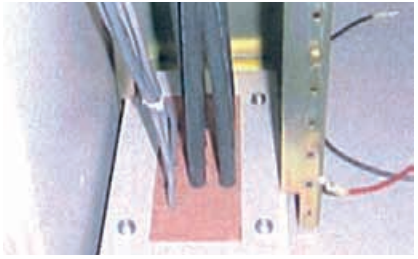
• Corrosion Protected lightweight transit is inserted into a turbine housing.