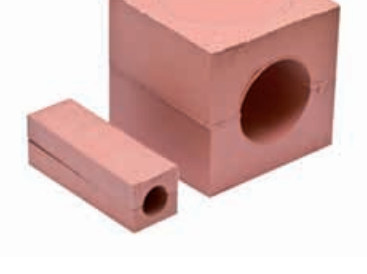
Standard Insert Blocks accommodates cables and pipes from 4 - 100 mm.

The other key element of the fl xible Brattberg system is the frame. We have full control over the manufacture of all variations, in different materials, in order to be sure that they meet both our own and statutory requirements for safety. The frames are made to be moulded, bolted or welded in place. There are also variations with open ends which allow for retrofi ting around existing cables or pipes.