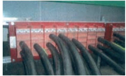
• Cable routing from the tower to transformer room