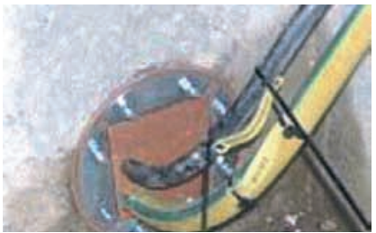
• RGP-transit enclosed in the power base.