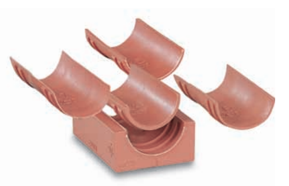
Each Addblock with its four insert sheets fits five different cable pipe dimensions.