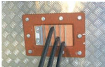
• Bolted transit for power cables