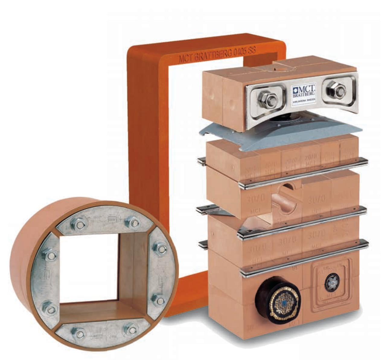
Fully adaptable to seal all configurations allowing future capacity and easy upgrades. MCT Brattberg is supplied locally all over the world.